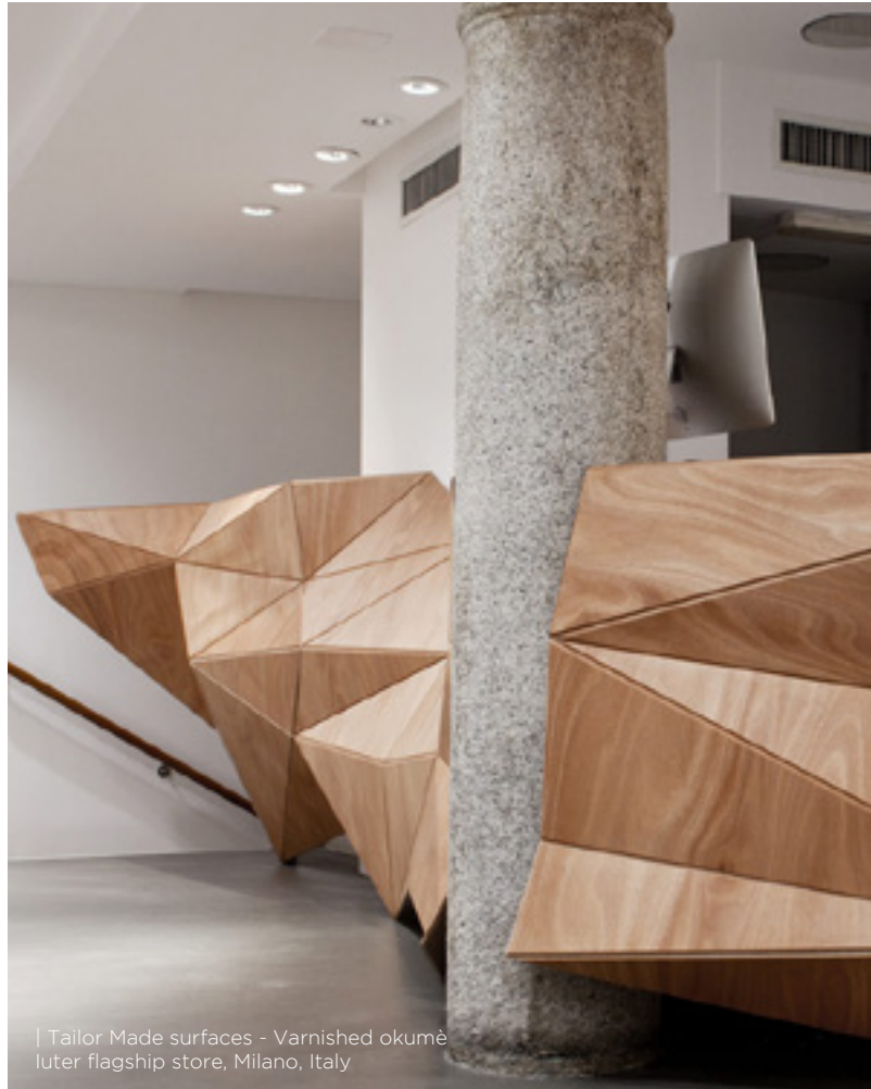
| Tailor Made surfaces - Varnished okumè luter flagship store, Milano, Italy

We work with hundreds of colors from different suppliers. Contact us for information at: info@wood-skin.com