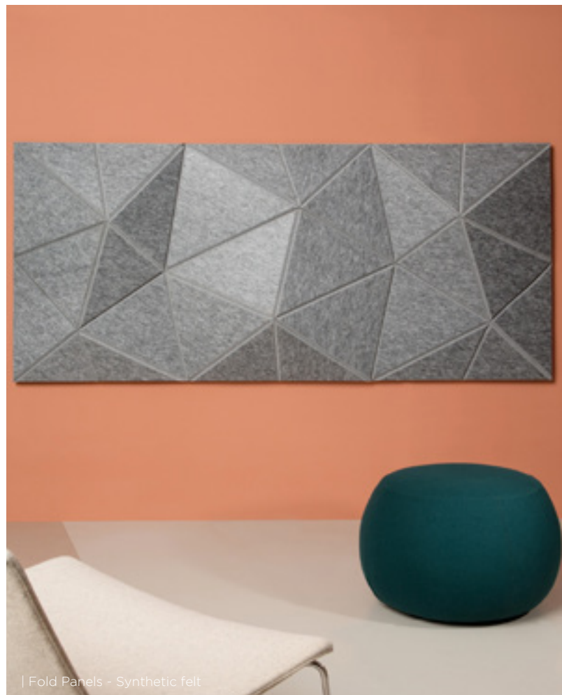
| Fold Panels - Synthetic felt

We work with hundreds of colors from different suppliers. Contact us for information at: info@wood-skin.com