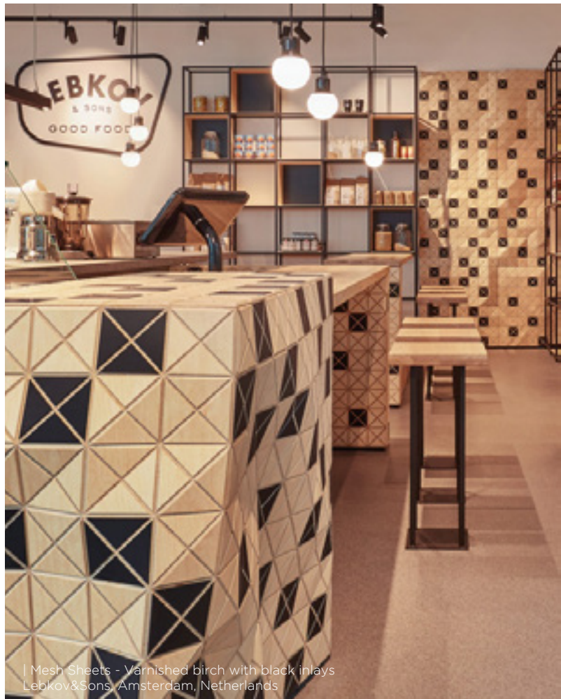
| Mesh Sheets - Varnished birch with black inlays Lebkov&Sons, Amsterdam, Netherlands

We work with hundreds of colors from different suppliers. Contact us for information at: info@wood-skin.com