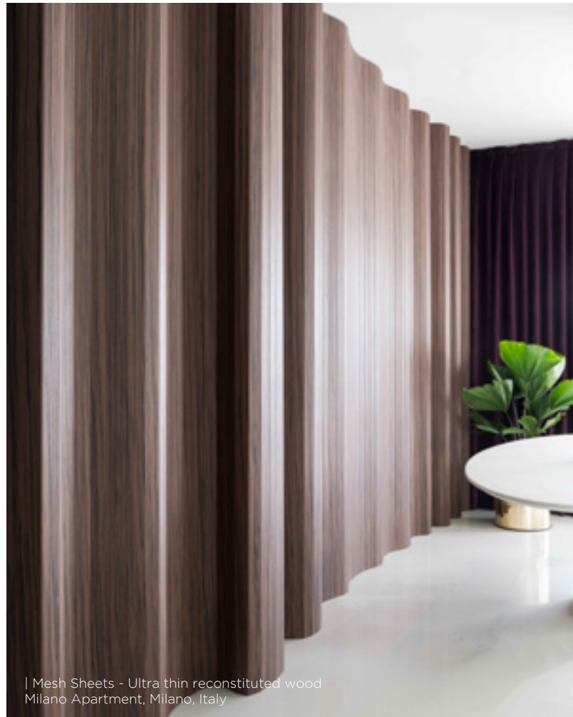
| Mesh Sheets - Ultra thin reconstituted wood Milano Apartment, Milano, Italy

We work with hundreds of colors from different suppliers. Contact us for information at: info@wood-skin.com